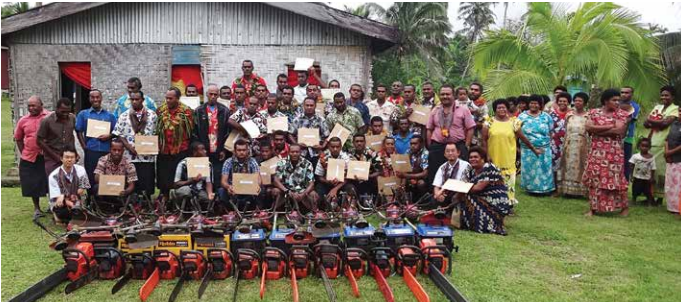
Participants at the Nasevou 2-stroke engine training