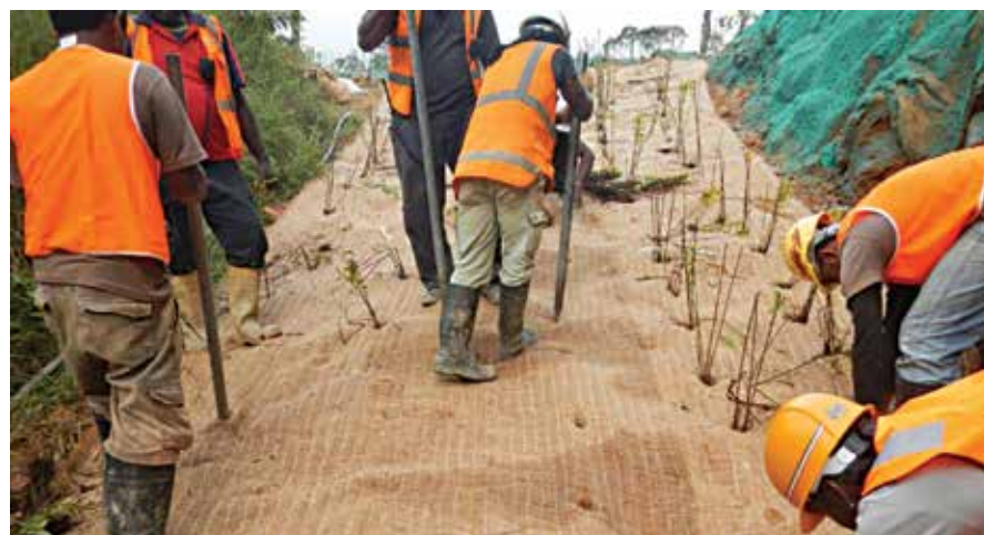
Rehabilitation of access track

The NJV has also reviewed and improved exploration processes including closer engagement with landowners, more careful planning of access roads, water management and drill pad preparation and rehabilitation.