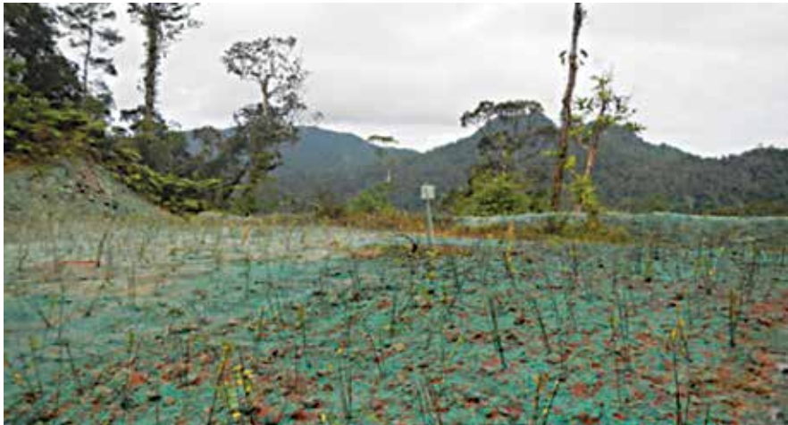
Rehabilitated site being replanted with ferns

The Namosi Joint Venture (NJV) has worked with local landowners and Government to plant more than 100,000 trees and ferns as part of a FJD $1.3 million Rehabilitation Action Plan.