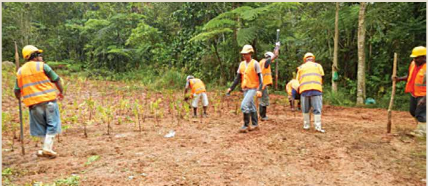
Replanting trees as part of the rehabilitation action plan

In partnership with the TNLC and local contractors the NJV has facilitated the employment of local community members as part of the rehabilitation program.