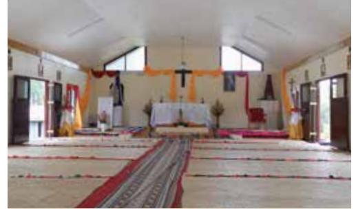
The newly opened Waivaka church

The head of the Catholic Church in Fiji, Archbishop Petero Mataka officially opened the Waivaka Village Parish on 21 July 2012.