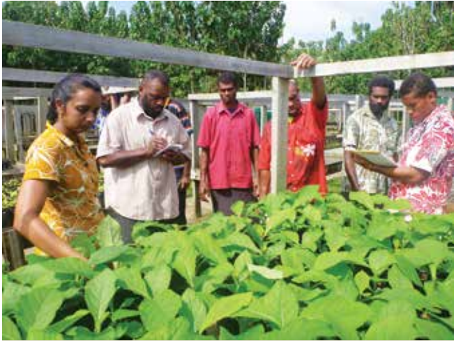
Matakaqi Naitavuni members taking notes at Mataso

The NJV, in partnership with Future Forests Fiji, facilitated a field trip in August for 18 members representing the Matakaqi Naitavuni from Delailasakau and Nasevou village.