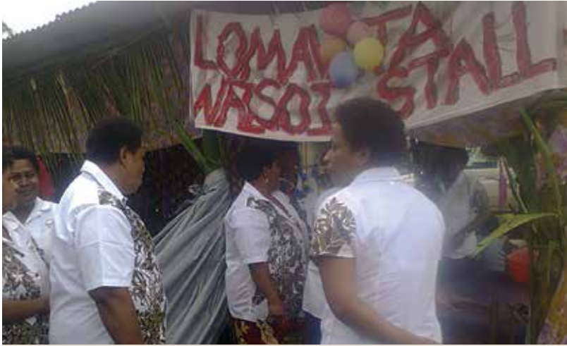
NJV employees at the Lomavata Waisoi stall

Namosi Secondary School held their annual bazaar on Friday 3 August 2012 at the school grounds.