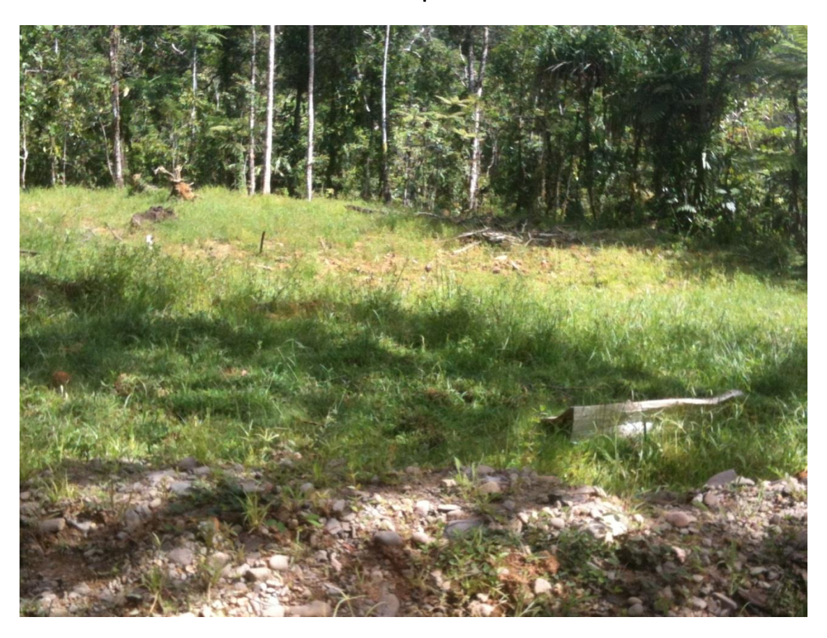
NVD 043 April 2014- local cattle do impact on rehabilitated drill sites