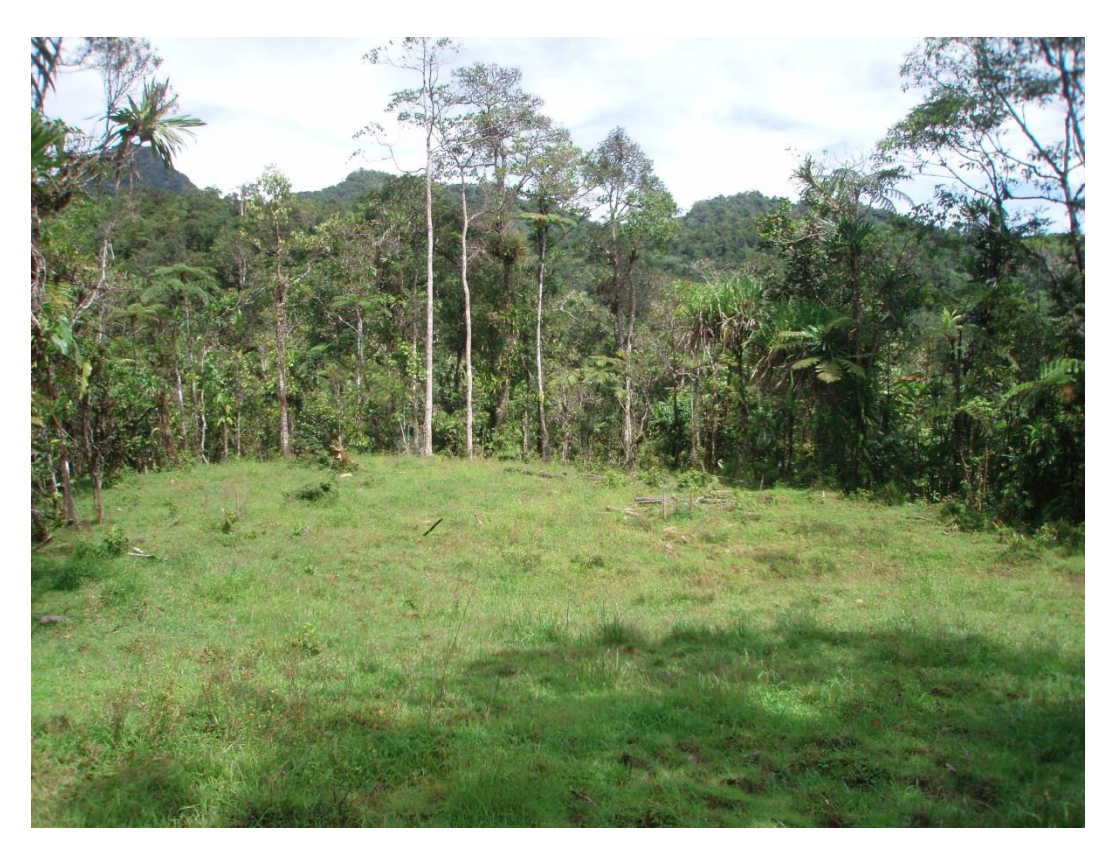
The initial phases of the rehabilitation work included the trial a number of techniques