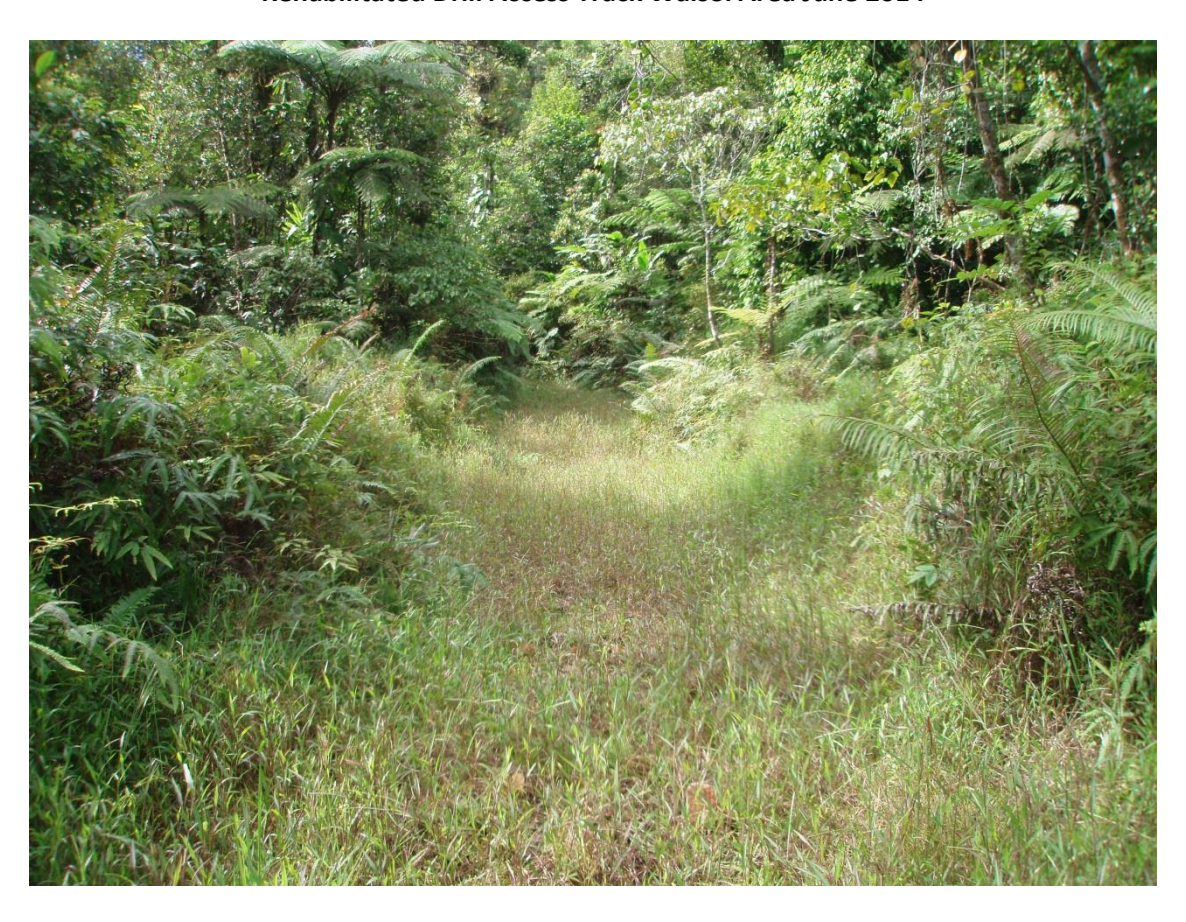
NVD 040 November 2014