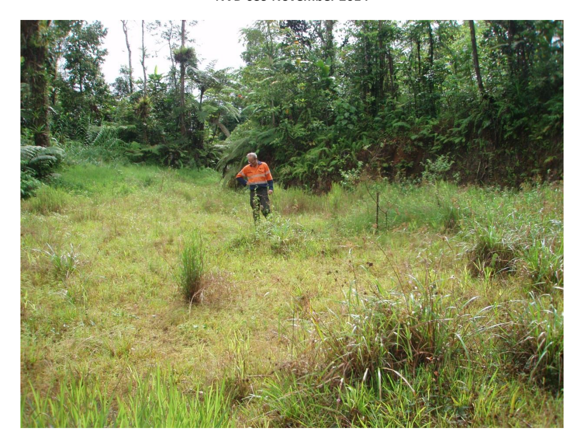
NVD 039 November 2014 – note self-seeding of trees from surrounding trees onto rehabilitated drill pad