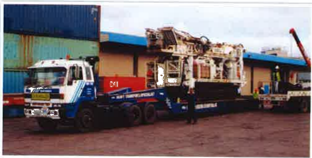
Trucks would carry construction machinery