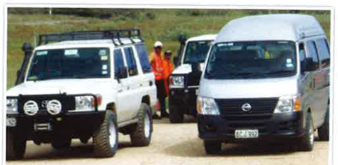
Cars and buses would carry project staff