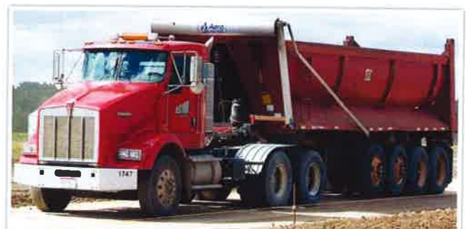
Trucks would carry copper concentrate to port