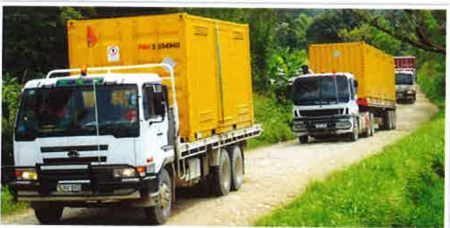
Trucks would carry construction materials